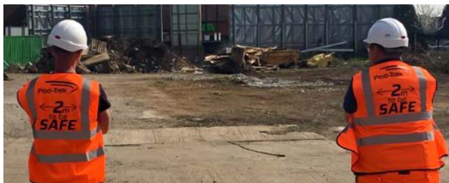
Uniform signage for workers to provide clear messaging

Establishing host responsibilities relating to COVID-19 and providing any necessary training for people who act as hosts for visitors.